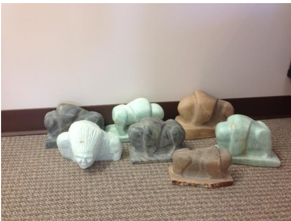
Carvings by White Buffalo clients December, 2013