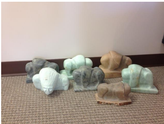
Carvings by White Buffalo clients December, 2013